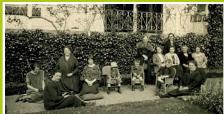
Convalescents at Cefn Ila c. 1925.