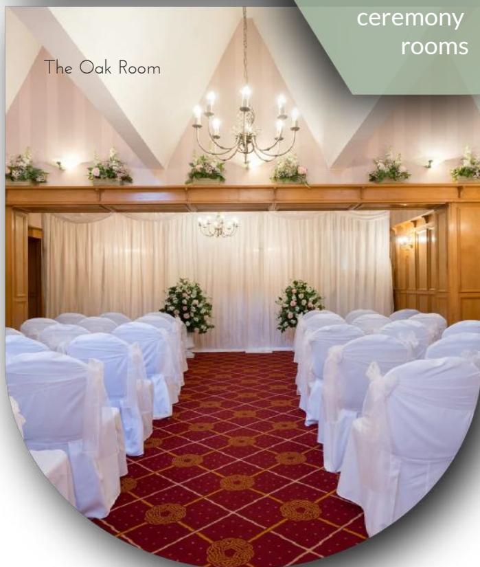
The Oak Room

A choice of four stunning ceremony rooms