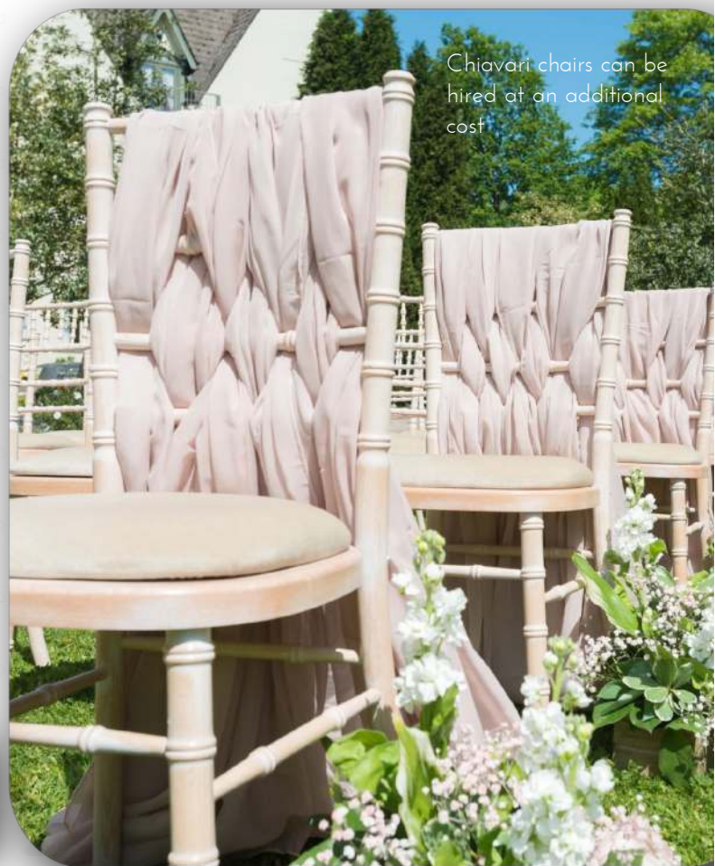
Chiavari chairs can be hired at an additional cost

For outdoor ceremonies, a microphone and sound system will be required. Hire charges apply - please ask for details