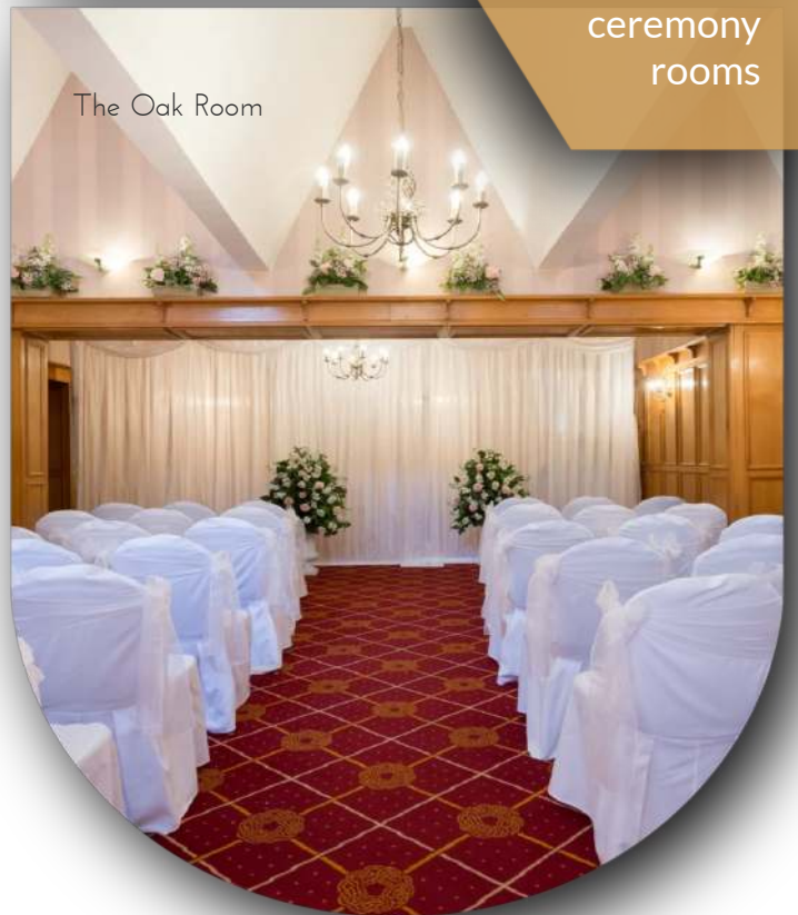
The Oak Room

A choice of four stunning ceremony rooms