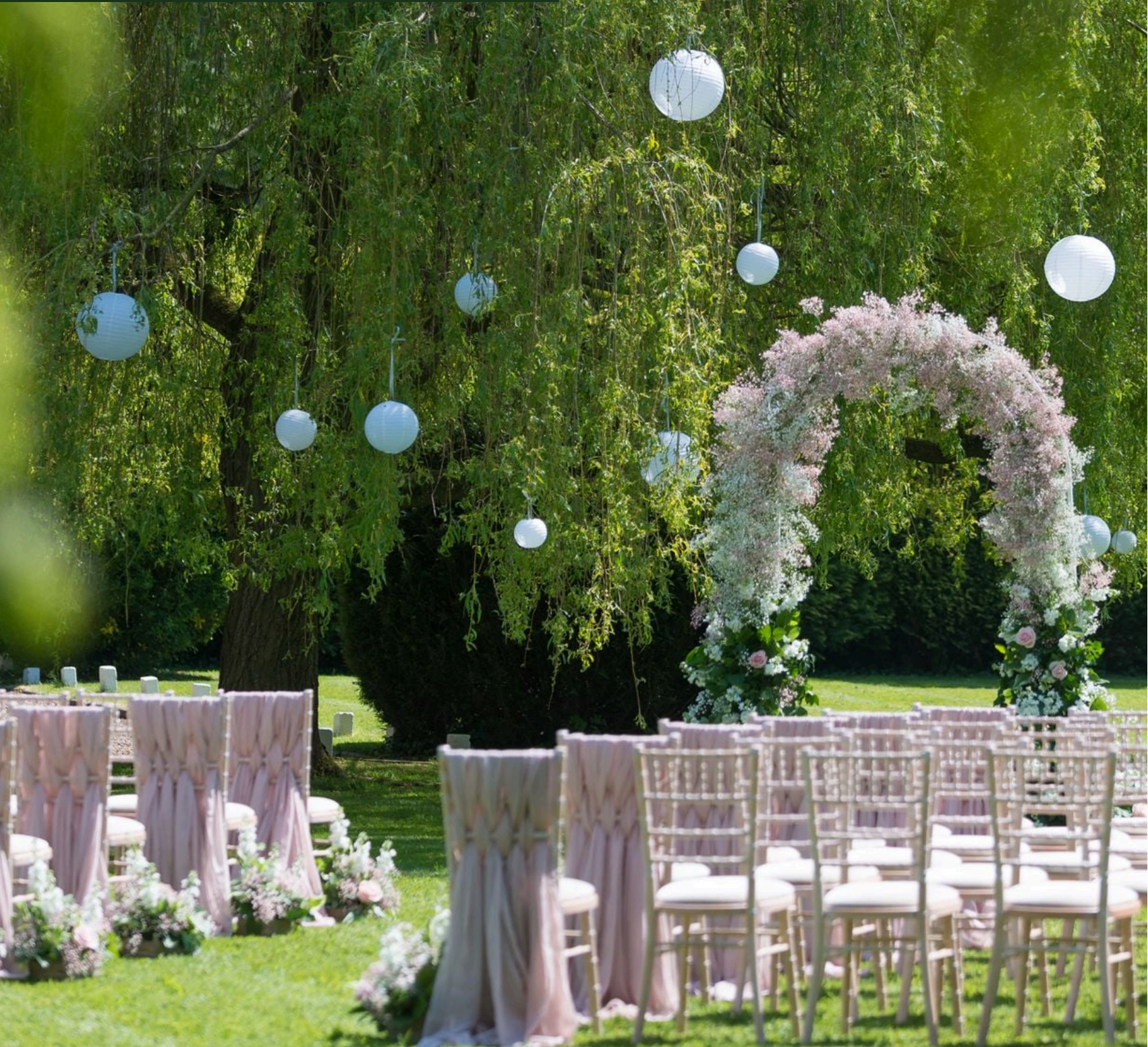
Our stunning grounds